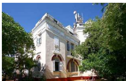
Bao Dai Villa